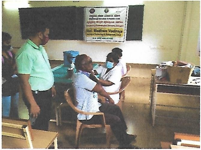
Lat: 13.254657 Long: 74.785719 Location: B Block – ECE Department

Principal Principal SHRI MADHWA VADIRAJA INSTITUTE OF TECHNOLOGY & MANAGEMENT Vishwothama Nagar, Udipi Dist. BANTAKAL - 574 115