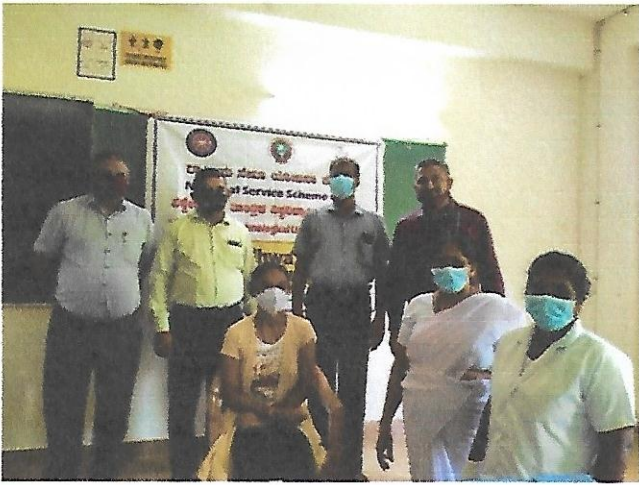
Lat: 13.254657 Long: 74.785719 Location: B Block – ECE Department