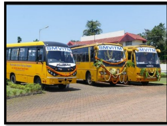
Ayudha Pooja- 05 October 2019