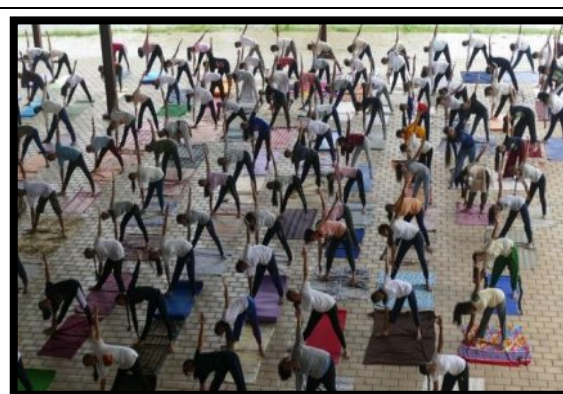
As a part of Azadi ka Amrit Mahotsav, National Service Scheme (NSS), Youth Red Cross Wing, NCC Unit and Yoga & Fitness committee celebrated International Day of Yoga with a theme “Yoga for Vasudhaiva Kutumbakam” on Tuesday, 21 June 2023.