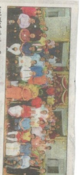
ಬಂಟಕಲ್ ಮಧ್ವ ವಾದಿರಾಜ ಇನ್ಸ್ಟಿಟ್ಯೂಟ್ ಆಫ್ ಟೆಕ್ನಾಲಜಿ ಅಂಡ್ ಮ್ಯಾನೇಜ್‌ಮೆಂಟ್ ಸಂಸ್ಥೆ ಆಯೋಜಿಸಿದ್ದ ಎರಡು ದಿನಗಳ ಆಧ್ಯಾತ್ಮಿಕ ಸತ್ಯಂ ಕಾರ್ಯಕ್ರಮದ ಸಮಾರಂಭದ ಸಮಾರಂಭ ಭಾನುವಾರ ನಡೆಯಿತು.