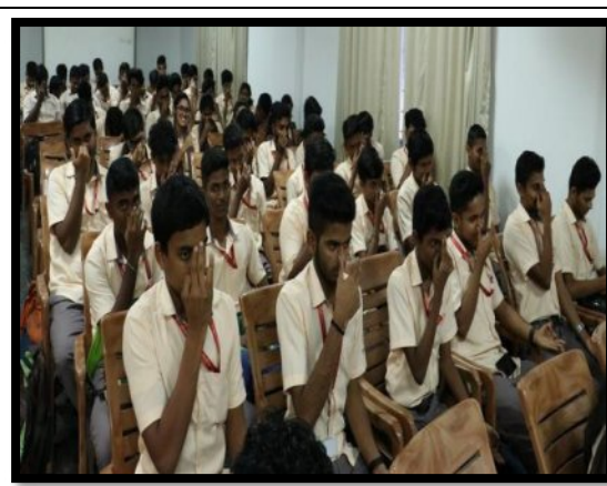
As a part of Azadi ka Amrit Mahotsav, and Har Ghar Dhyan Campaign, Ministry of Culture, Art of Living Foundation Bengaluru, NSS-YRC Unit and Yoga & Fitness Club of SMVITM, jointly organized a session on “Meditation and Mental Health” on Friday, 13 January 2023.