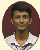
SUNIL S SHETTY